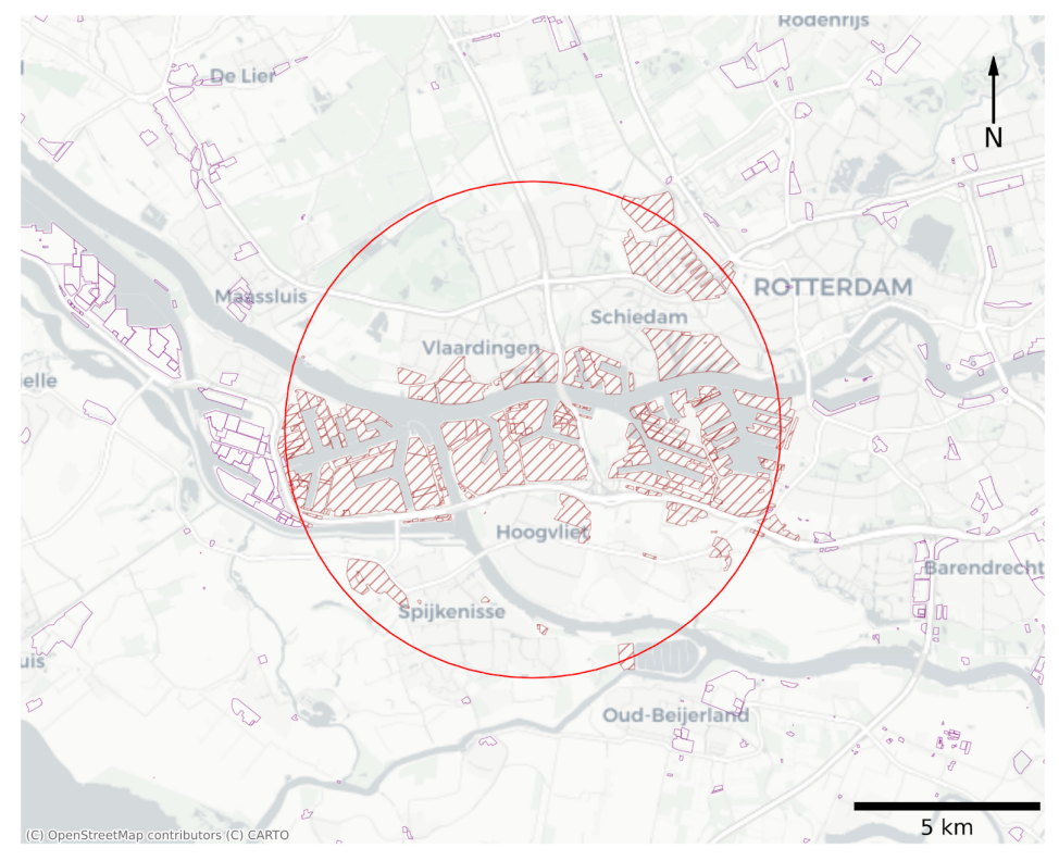
Fig. 2 Example application of industrial damage assessment methodology. The red circle represents the predicted destruction radius for a 300 kt detonation over the Port of Rotterdam. Industrial zones from OpenStreetMap are shown as polygons, with hatched areas indicating zones considered destroyed based on their intersection with the destruction radius.