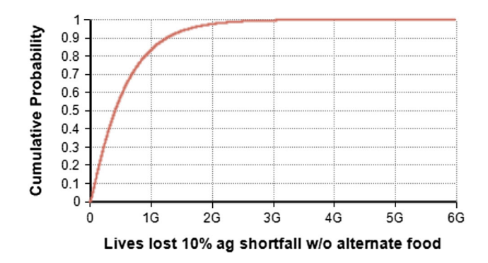
Fig. 2 Cumulative probability of lives lost given a 10 % agricultural shortfall and no alternate food (G is billion)

the number of lives saved per year would likely increase because of population growth. With an expected total lives saved and cost of plan, the cost per life saved is calculated.